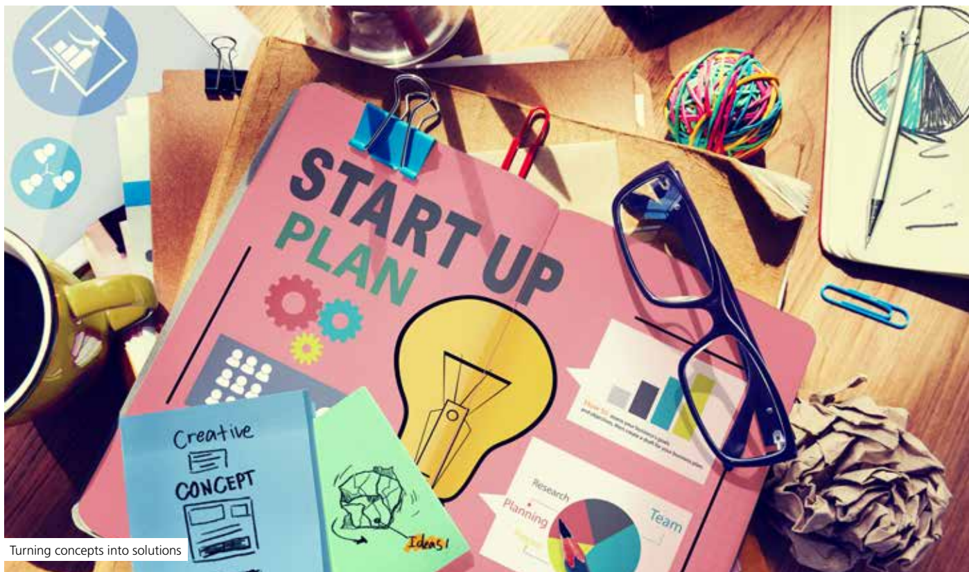
Turning concepts into solutions