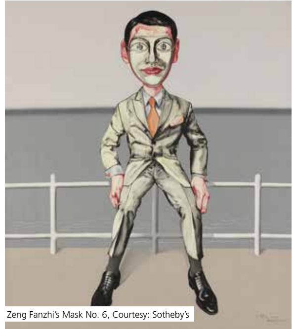
Zeng Fanzhi's Mask No. 6