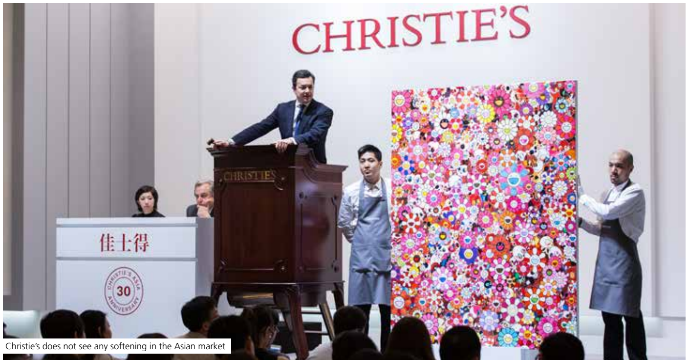
Christie's does not see any softening in the Asian market