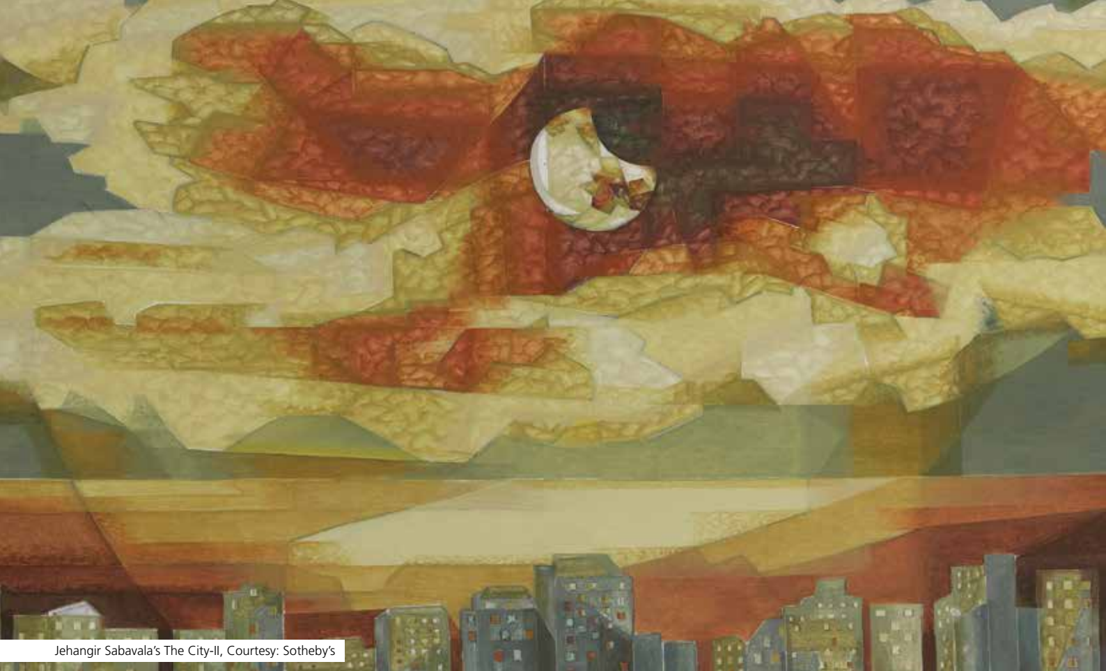
Jehangir Sabavala's The City-II